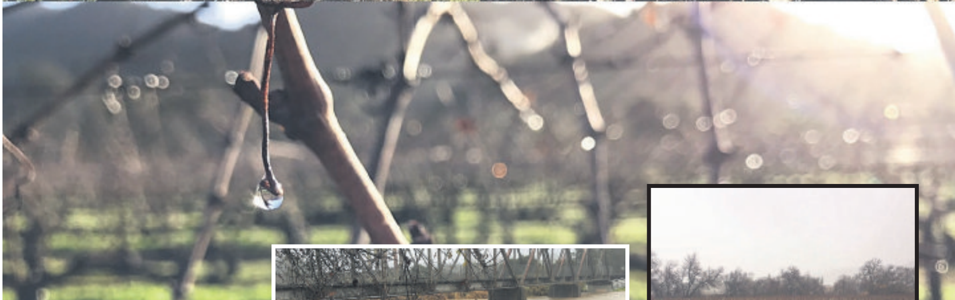
ABOVE: The sun, the soils and the vines. All are good in the Napa Valley following the epic rains of January 2017.