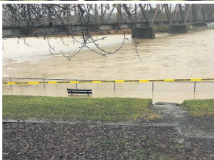
LEFT: The Russian River as it rose near Healdsburg. After five years of drought the rising rivers were seen as a blessing in California wine country.