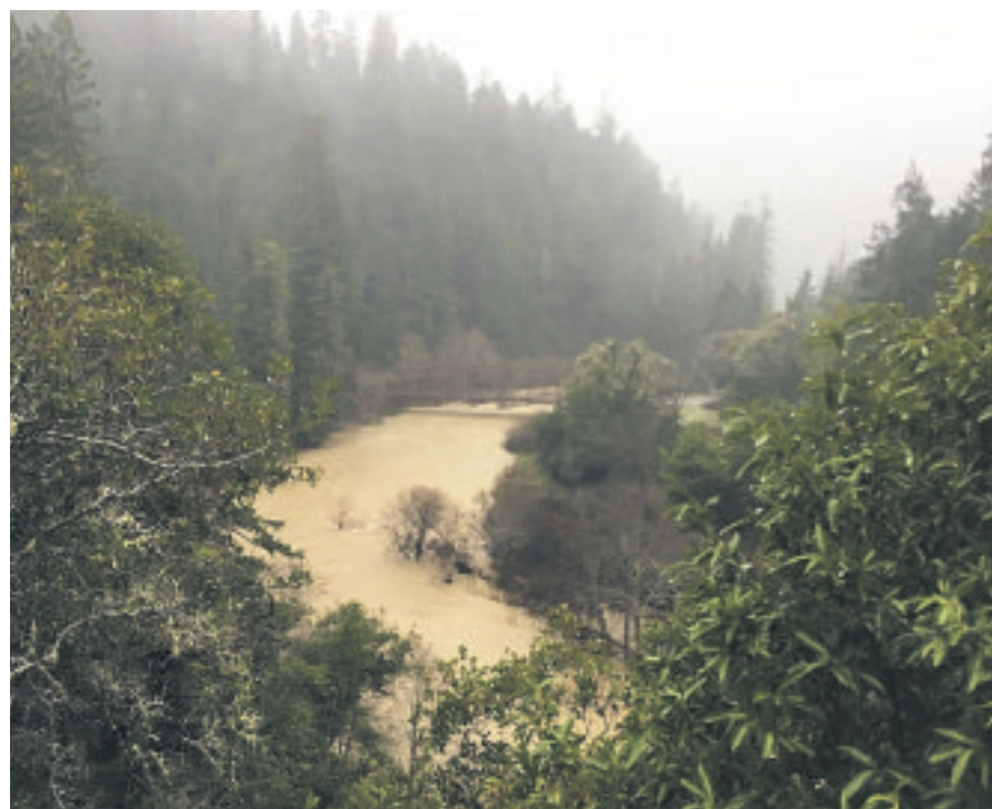
The "little" river below the Peay Vineyard, the Wheatfield Fork of the Gualala River, flows freely in the midst of the deluge.

established with permanent cover crop, so erosion is minimal," he continued. "It is also likely we will not need to water as much, if at all, in most places in our vineyard. There are so many variables that will affect the growing season that this is only one potential small factor."